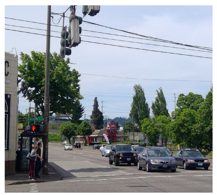
Looking west on SE Powell Blvd at SE Milwaukie.

The cost to upgrade Inner Powell to a state of good repair would be about $31 million. This cost is subject to change depending on construction year. The breakdown of costs is shown to the right.